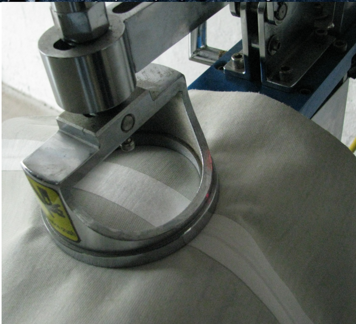
Diagram to the right illustrates TORANT® fabric tested under pressure.

TORANT® fabrics and manufactured to be extremely waterproof and durable.