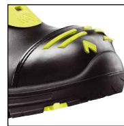
HAIX® High Durability Cap System