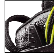
HAIX® Climate System