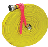
25mm Fire Hose

The RANGER 800 has a burst pressure of 5250kPa and a working pressure of 2100kPa having an all synthetic jacket, the Ranger 800 is unaffected by mildew and will retain its strength and durability under all climatic conditions.