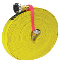
38mm Fire Hose