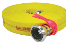
65mm Fire Hose