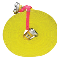
65mm Fire Hose