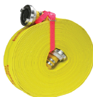
65mm Fire Hose