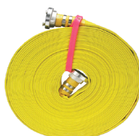
38mm Fire Hose