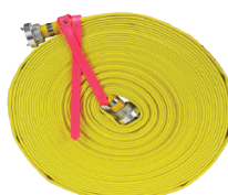
25mm Fire Hose