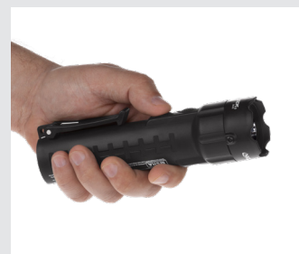
Large, textured buttons