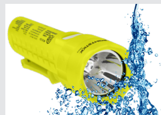
Durable polymer body is impact & chemical resistant