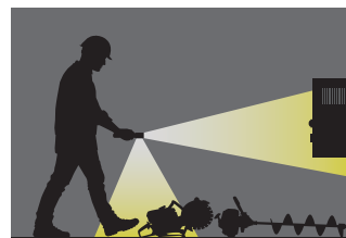
Simultaneous flashlight and floodlight operation