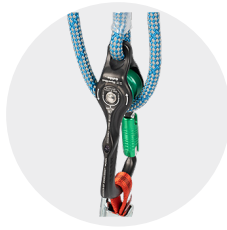
Improved pulley system