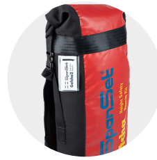
Ergonomic bag design