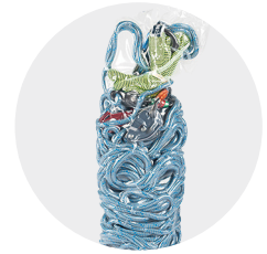
Environmentally sealed packaging