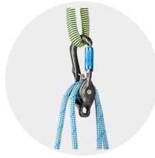
Colour coded components